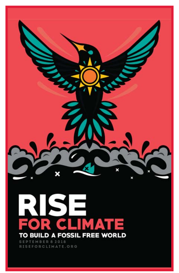
Poster art by Columbian Graphic Artist Jhon Cortés