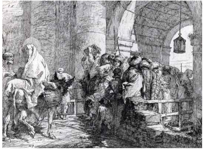
Upper right, The Flight into Egypt: The Holy Family Arriving at a City Gate, Giovanni Domenico Tiepolo (1753).