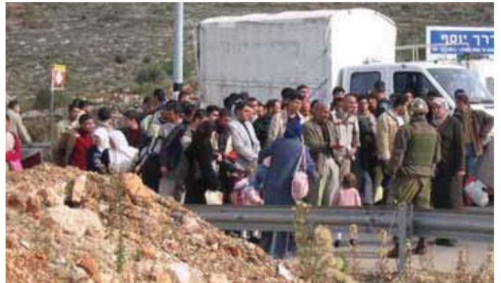
Lower right, "Palestinians wait on foot to get through Zatar checkpoint." http://www.annainthemiddleeast.com/photos/checkpoints/40